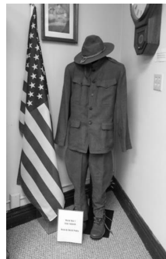
Part of the World War One Display