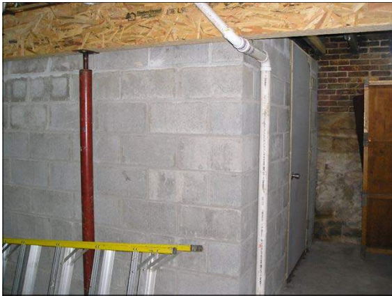
Construction in the basement