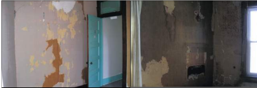
Two of the upstairs rooms that will be included in the renovations.

We are starting to remodel the second floor. We have installed a new furnace and central air conditioning upstairs. Now we are beginning to re-plaster and paint each room. Five rooms are usable as they are. Those rooms are already being used for storing items. Three rooms are currently "under construction" using existing funds. We are awaiting a $25,000 grant from Bob Robbins which will be used to finish the other rooms, purchase paint and storage/display cabinets.