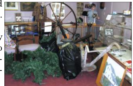
The current condition of the museum

We are planning to open on April 14 th . Our hours will remain as they have in the past – 12 PM to 3 PM, Tuesday through Saturday . Due to the remodeling on the second floor the museum will not be in its usual pristine condition. Like Penn Dot, "we apologize for the temporary inconvenience," but look forward to the permanent improvement.