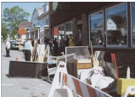
Second floor clean-up.