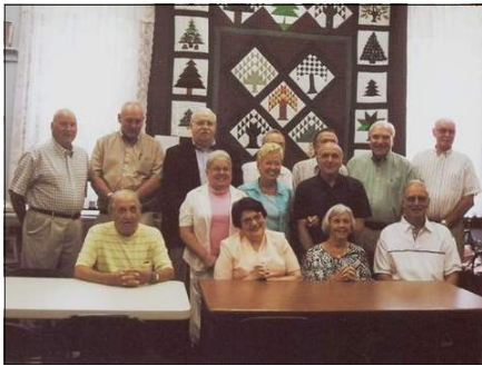
Class of 1963