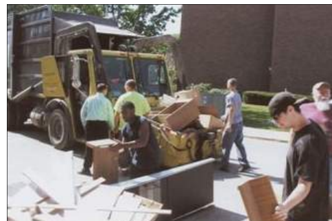
Second floor clean-up.