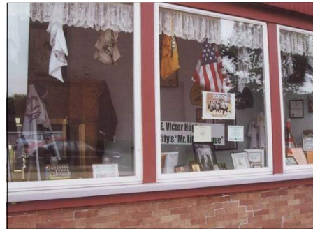
Vic Hughes Little League window display.