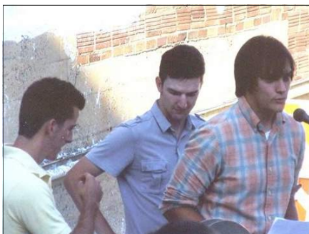
Guthrie Mural Artists