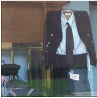
Salute to Service Members window display.