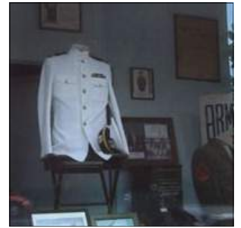
Salute to Service Members window display.