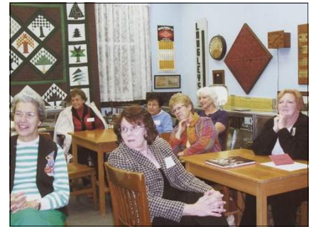
Delta Kappa Gamma