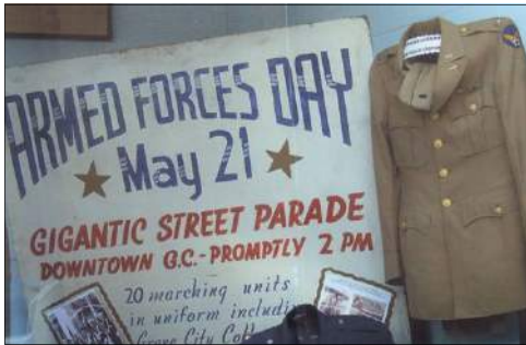
Salute to Service Members window display.