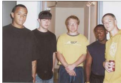
GJR volunteers for 2nd floor clean-up day.