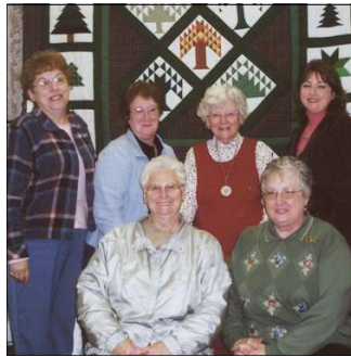
Daughters of the American Revolution