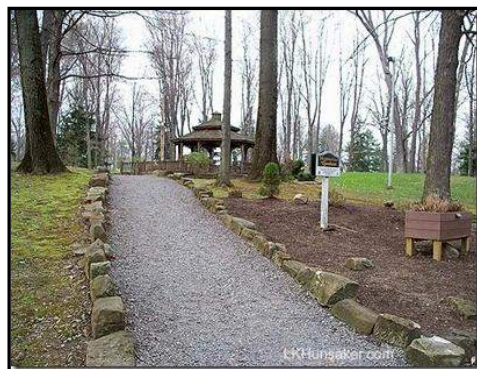
Above