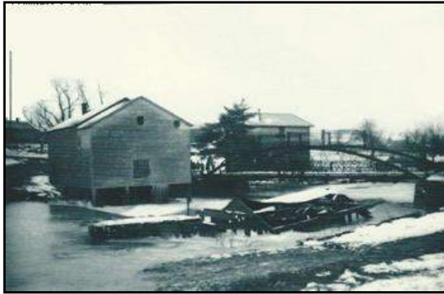
This area is now known locally as Hallville.